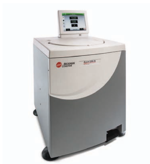
Avanti JXN-26 Centrifuge

Maximum acceleration in a centrifuge is mandated by a number of factors, including the geometry and weight of the rotor, power of the motor, and frictional drag resulting from wind resistance and rotor mechanics.